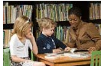
Traits of Effective Teaching: A Retired Educator's List

KDP Headquarters has been located in Indianapolis since 1999.