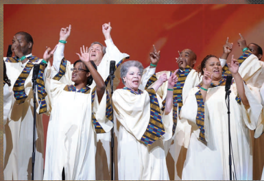
St. Alphonsus Liguori "Rock" Catholic Church Choir