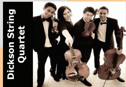
Dickson String Quartet

For additional information, please call the Office of Equal Opportunity and Diversity at 516.5695 or visit www.umsl.edu/services/oeo