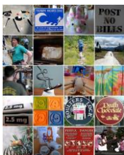
Image of a bingo card