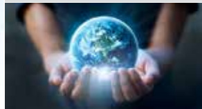
Intro to Sustainability