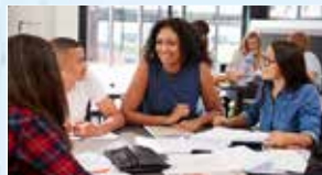
Classroom Management Basics