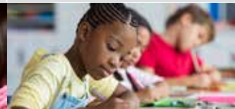
Student Responsibility for Learning

Market your company through Educator Learning Network! Logo featured prominently in course. Sponsorship opportunities are available at $5,000 per course.