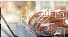
Data Literacy for Teaching